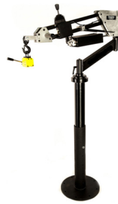
Adjustable Pedestal Mount

Visit our website at www.StudWeldProd.com or email Info@StudWeldProd.com